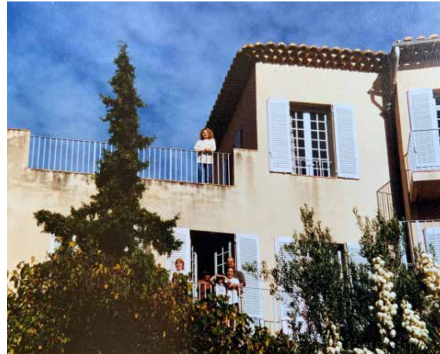
FORMER FELLOWS WITH THEIR FAMILY IN 1996

Animals other than officially registered service animals are not allowed. Fellows are responsible for securing all necessary documents and meeting all standards if bringing a service dog from outside of the country.