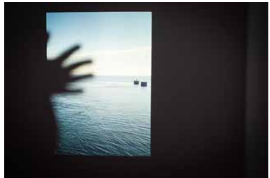
AUDIOVISUAL INSTALLATION, OPEN STUDIO SPRING 2024, VK PRESTON

Professional translators are eligible to apply. Academic translators who meet the eligibility requirements for Scholars can apply under the Scholar category. Literary translators with a theoretical or research-oriented project are encouraged to apply under the Thinker category. Translators who frame their practice as creative writing can apply under the Writer category. Applicants are welcome to choose the category they prefer according to their specific project and profile.